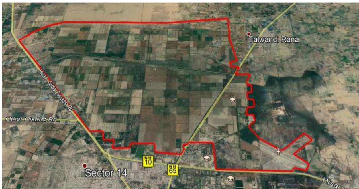
Figure 71: Boundary of proposed aviation hub on google image