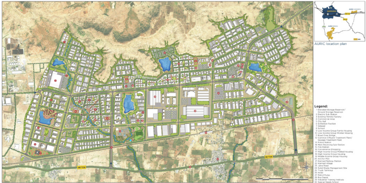
Illustrative Master Plan for AURIC Shendra