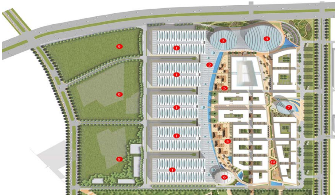
Layout concept through Preliminary Master Plan

The district includes 260,000 sq.m of exhibition cum convention space (200,000 sq.m Exhibition & 60,000 sq.m Convention), a Sports Arena of 50,000 sq.m, 275,000 sq.m of hotel space and 385,000 sq.m of commercial space for retail & entertainment and Class-A offices. The total built up area for the ECC district is approximately 10,20,000 sq.m. The size and diversity of the project suggests that each area will have unique feature that defines both, the challenges and the opportunity to stimulate investment and generate a desirable level of success.