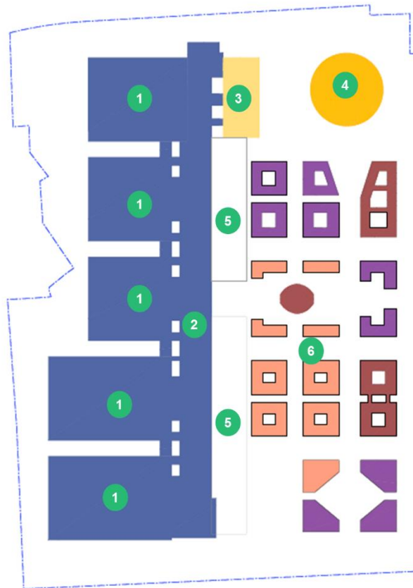
Layout concept plan of ECC through preliminary master plan