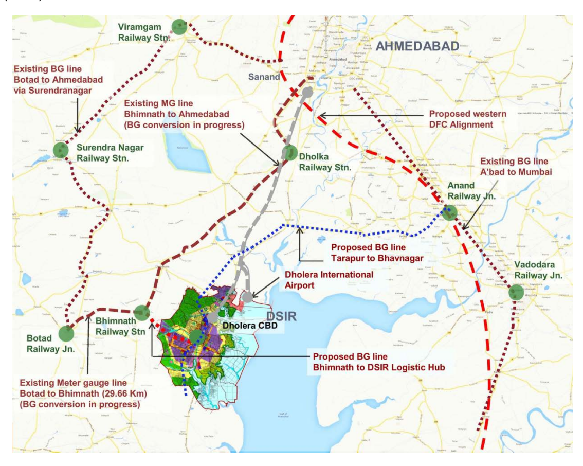
Figure: Existing Rail connectivity in proximity of major cities of Gujarat

New rail line of 30 km length to be developed between Bhimnath and proposed Logistic hub in Dholera. It will act as feeder route to Dedicated Freight Corridor (DFC).